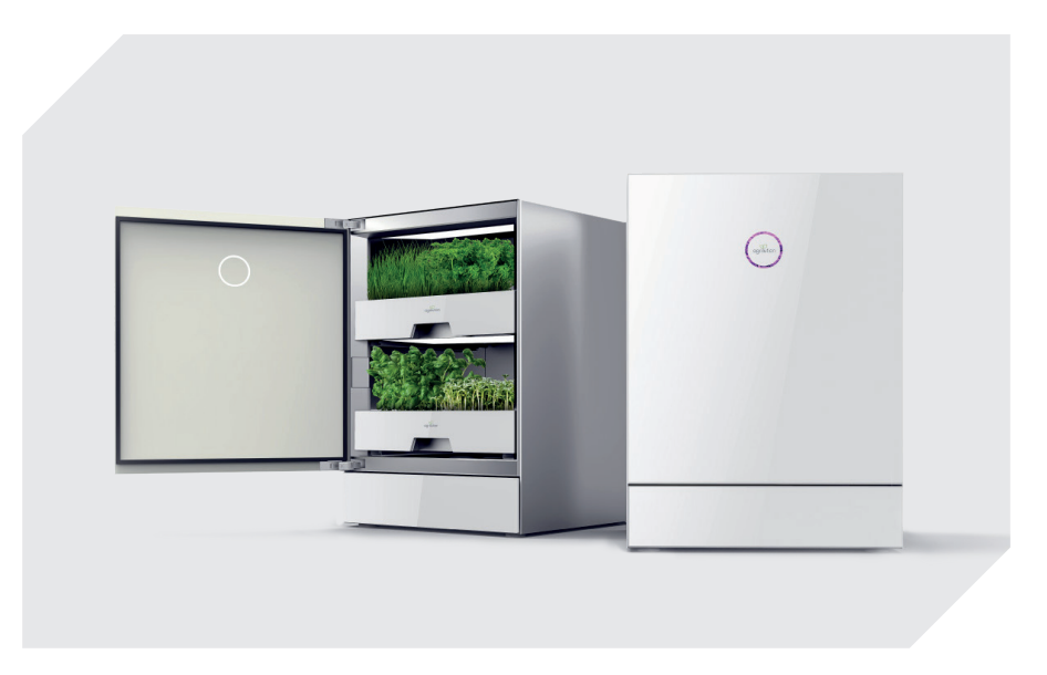
The vertical farming solution from Agrilution enables fully automated cultivation of healthy food in a kitchen cabinet.