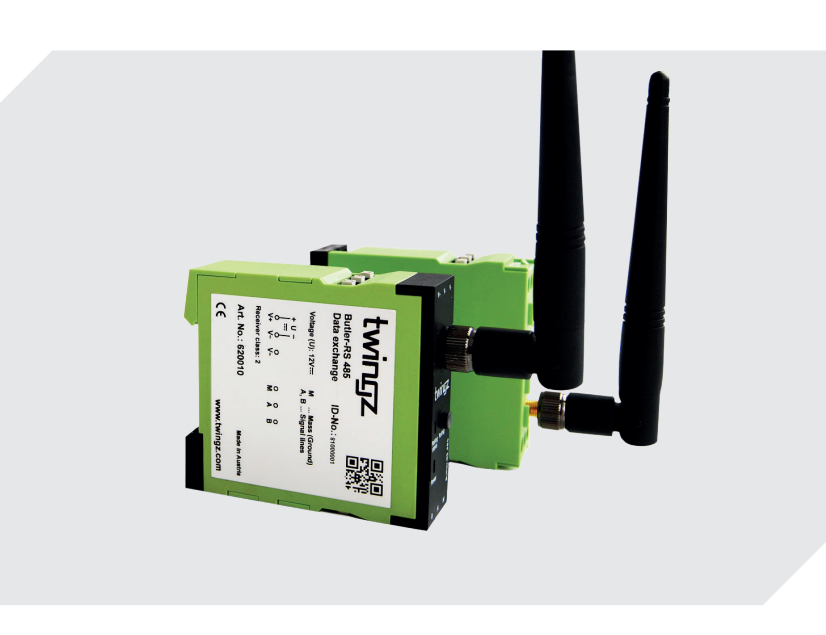
eButler from twingz helps housholds reduce their energy costs by upt to 40%