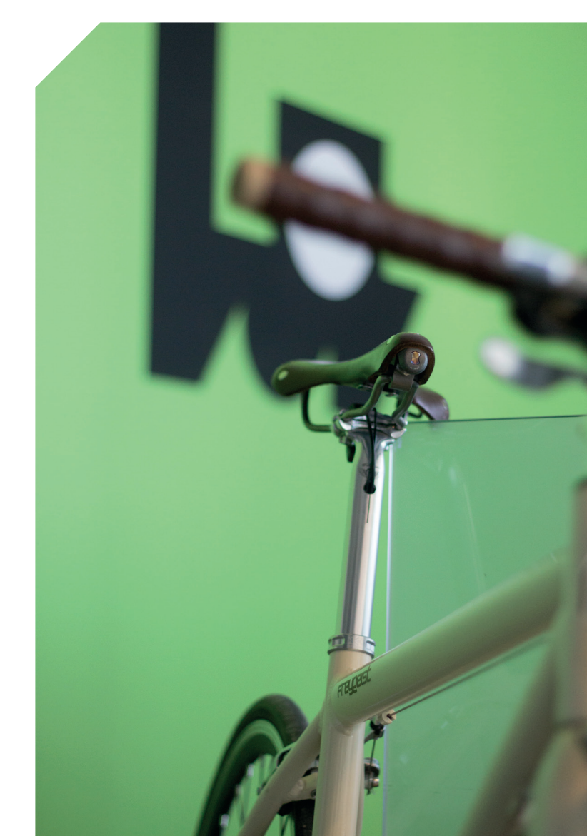
The premium e-bike from Freygeist is more than just cool and beautiful, it is also very lightweight and fast.