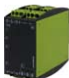
G4UF500V03 Art.No. 2394504