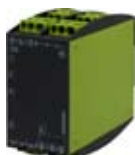
G4UF900V01 Art.No. 2394505